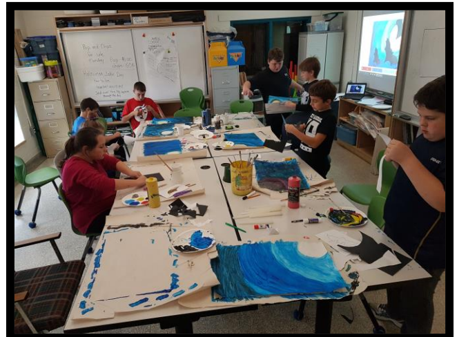
Intermediate Class working on Halloween Art